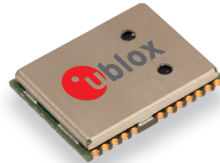
NEO-7 series: 12.2 x 16.0 x 2.4 mm